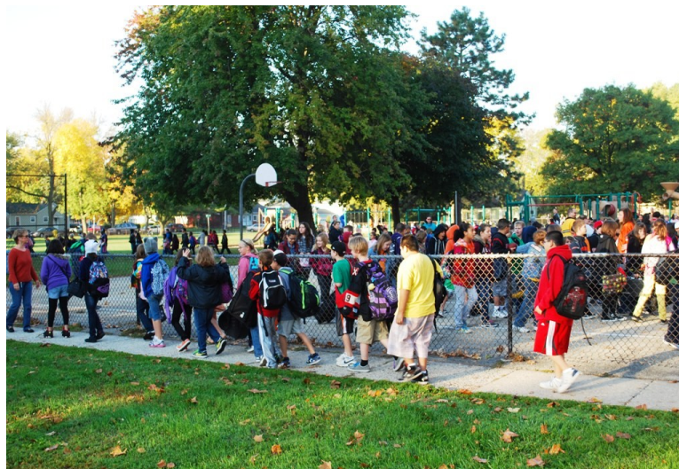
Walk to School Day at Freeman Elementary School, Aurora